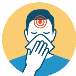
CONGESTION OR RUNNY NOSE