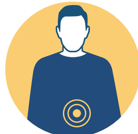
NAUSEA OR VOMITING