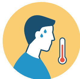
FEVER 100.4* *or school board policy if threshold is lower