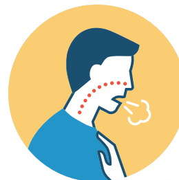
SHORTNESS OF BREATH OR DIFFICULTY BREATHING