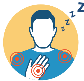
MUSCLE PAIN AND FATIGUE